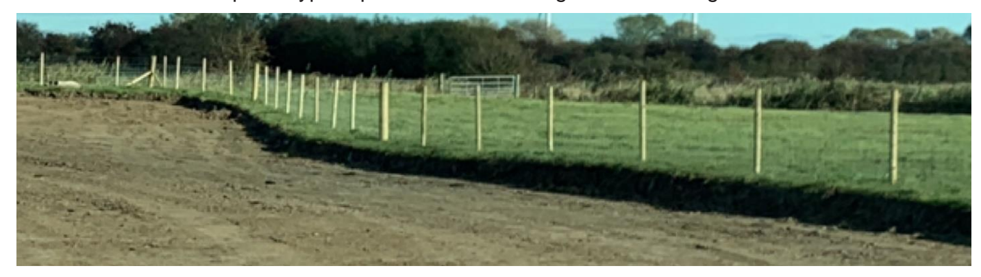
Figure 1.2: Example of post and wire fencing